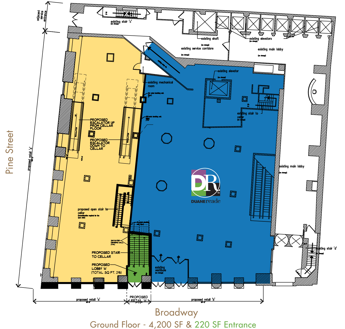
Ground Floor Plan Divisions: