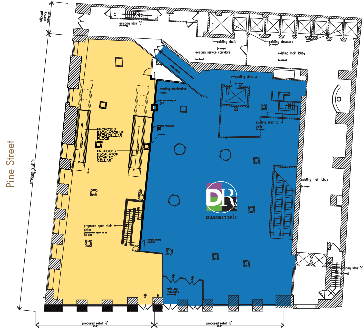
Broadway Ground Floor - 4,440 SF